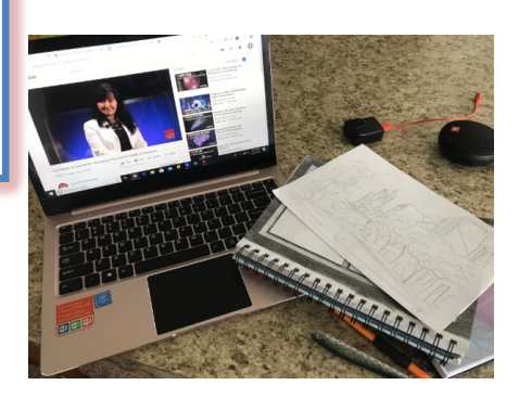
Jelly Ramos recommends getting into your hobbies! Drawing, music, and online videos are a great time passer!